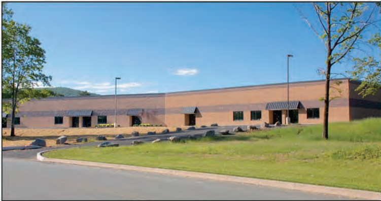
The Corporate Center is ideal for flex buildings like this one on Hillside Drive.

After you read about some of the benefits our Corporate Center offers, call us and we'll help you find the site that meets your needs.