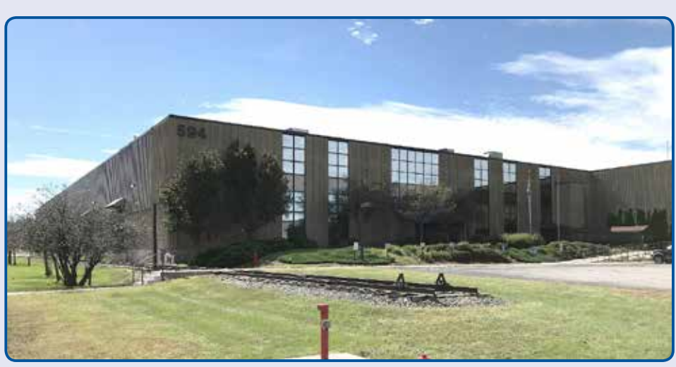
Pro Con signed a lease for a 242,960 square foot facility in the Humboldt Industrial Park. This is the company's third facility in Greater Hazleton.