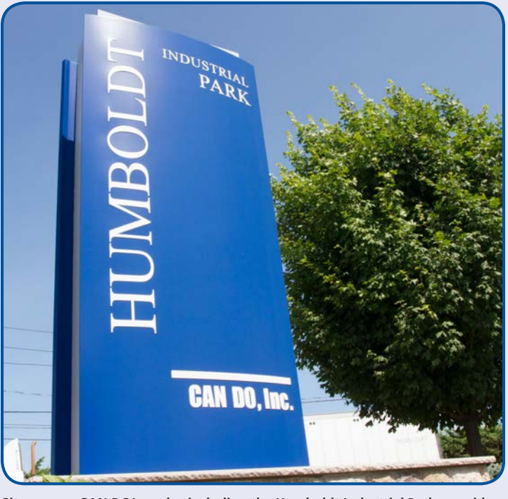
Sites across CAN DO's parks, including the Humboldt Industrial Park, provide companies easy access to the interstate highways and utilities.

"As some of the earliest developed submarkets began to see limited opportunities for additional development, tenants expanded their search criteria along the major interstates with a focus on transportation ease and labor availability. Northeast PA, and Greater Hazleton in particular, are unmatched in this regard," he said. "The abundant labor force with a reputation for great work ethic has long drawn manufacturing and other industries to the area. Beyond that, the readily available utilities and roadway